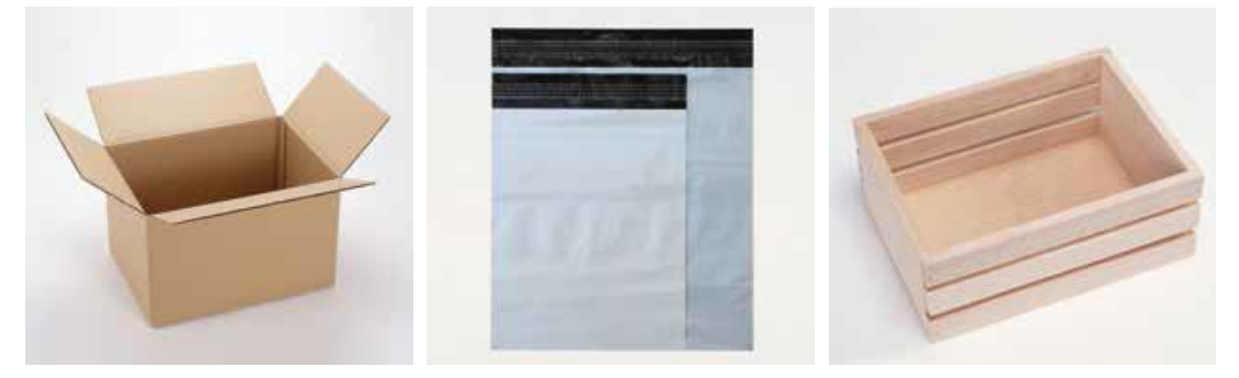
Did you know?

Example: Envelope, plastic bag / flyer, double-walled carton box, wooden box etc.